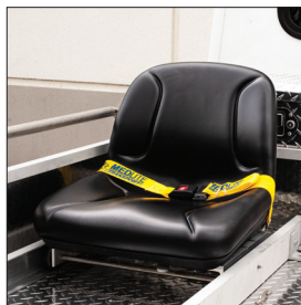
Three-position lock guide seat with seatbelt