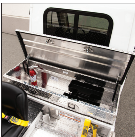
Lockable storage with fire extinguisher

The enclosed cab** has room for two, and keeps the operators and attendants protected from the elements while waiting on the sidelines. Once in action, the floor of the bed package of the ABLE EMSo is only 30 inches off the ground, making it easier to lift a loaded stretcher into place. With a step-up bumper, sturdy diamond plate construction, steel hand rails, and extra security straps it is easy to load and transport both attendant and patient.