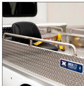
Attendant (and patient) stainless steel grab bars (one on each side of vehicle)