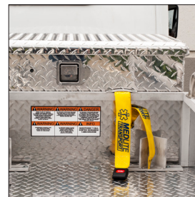
Secondary locking security strap