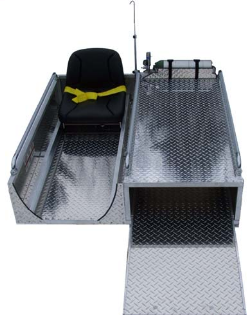
MEDLITE™ Transport Deluxe